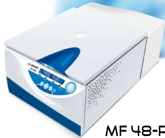
MF 48-R Réfrigerated