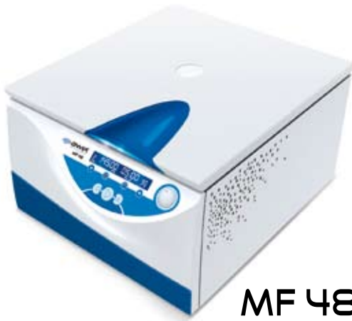
MF 48 Ventilated